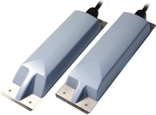
BELUGA 45° & BELUGA 20°

The BELUGA is the newest digital ACOUSTIC area/velocity flow meter sensor for open channel flow measurements from FLOW-TRONIC. It is suitable for partially filled pipes and surcharged pipes without primary devices such as flumes or weirs.